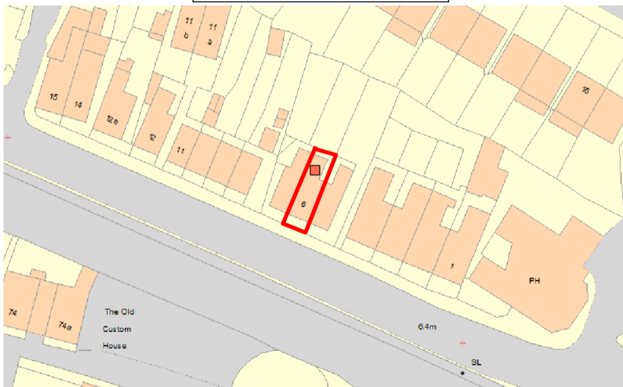
6 New Road, Leigh on Sea, Essex