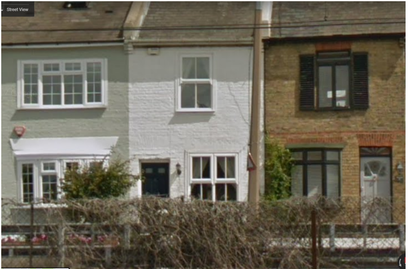
6 New Road, Leigh. (Middle Cottage) View across railway line from Old Leigh